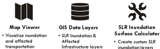
Figure 2: Icons depicting functions of the Sea Level Scenario Sketch Planning Tool