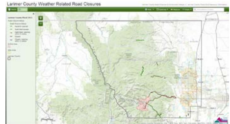
Figure 5: Screenshot from Larimer County's weather-related road closures application.

To distribute this information about road closures throughout the county, staff created a public-facing website in under 5 hours, using a Google map front-end, dynamic segmentation techniques, ArcMap, Python, and ArcGIS Online. The website served an immediate need at the time, and has been so reliable that it became a model for the future, more robust version of the road closure website.