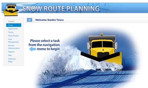
Figure1: Snow Route Planning Application.

The application was developed by a contractor, Geo-Decisions, at an initial cost of $99,000 in 2013 and an additional cost for enhancements at $77,000 in 2014. District staff developed the majority of reports mining data from the application, which helped in controlling costs.