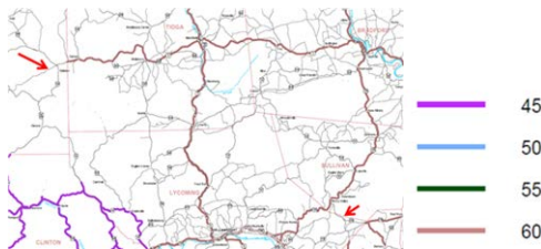
Figure 3: A portion of the statewide anti-icing map to assess corridor consistency

As a result of the assessments, several updates to policy manuals and training programs for winter services are currently underway. A number of county maintenance managers have also started to optimize snow route assignments, change winter management strategies, and evaluate opportunities for savings. Staff presented to executive staff in August 2014. Subsequent to this presentation, each of the 11 engineering districts were required to identify at least one objective that would reduce cost or improve efficiencies in winter operations. In November 2014, districts identified the potential for $1.5 million to $2.4 million in savings during state fiscal year 2014-15. Several areas of potential savings included: