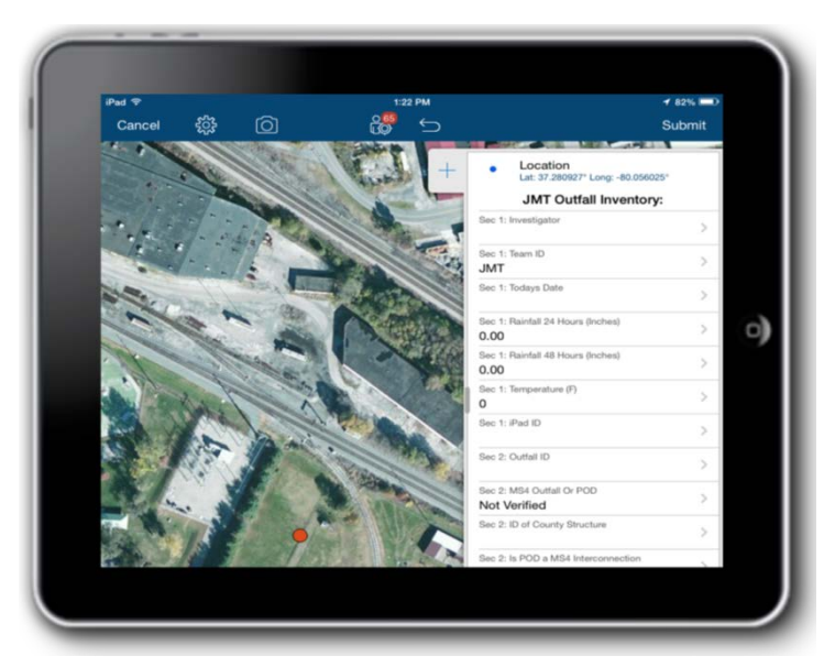
Figure 1. VDOT's MS4 Mobile Collection Tools.

Recognizing that the consultant would be able to deliver a solution within a short turn-around period and within a small budget, and that they could use an out-of the